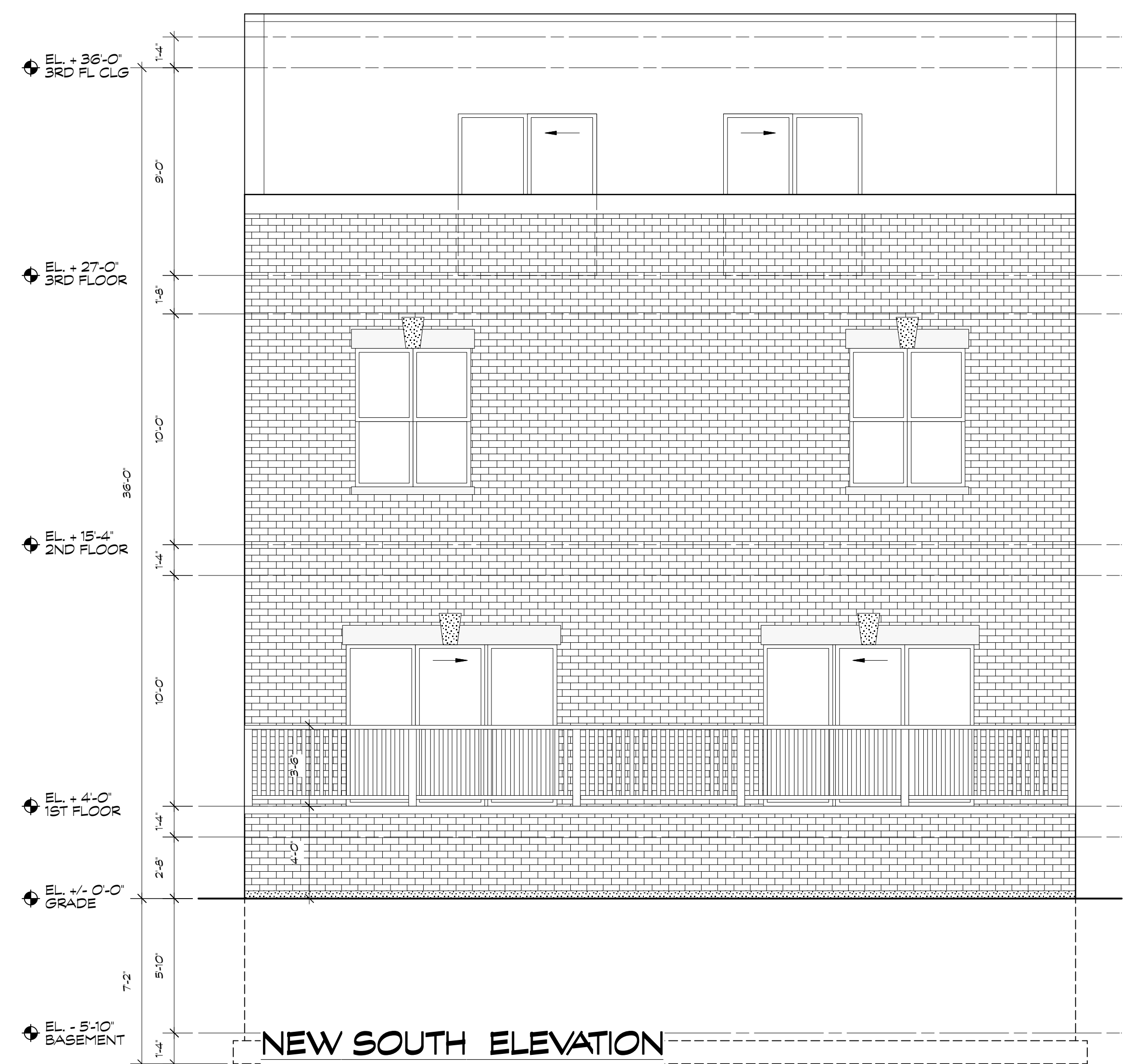
NEW SOUTH ELEVATION