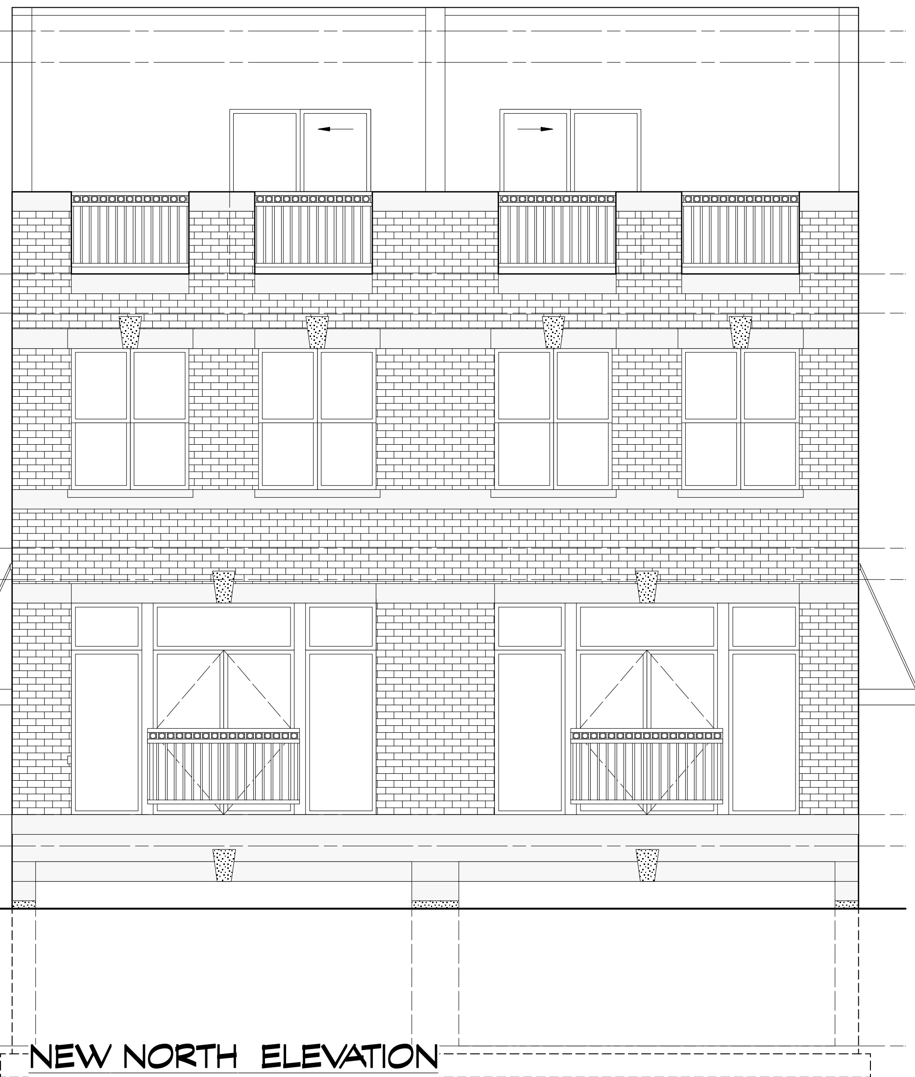
NEW NORTH ELEVATION